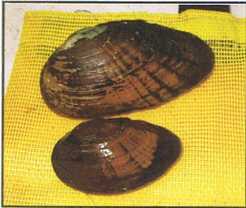
Figure 4. Triangular Kidneyshell ( Ptychobranchus greenii ) [top] and finelined pocketbook ( Hamiota attilis ), 2 federally protected mussels that were found throughout the study reach.